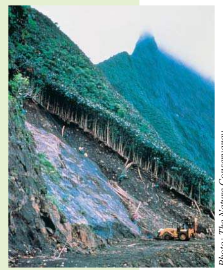
Miconia on a mountainside in Tahiti

A highly ornamental tree from South America, Miconia was introduced to a botanical garden on the island of Tahiti in 1937. Its huge red and purple leaves made it highly desirable for gardeners. It was spread into the wild by fruit-eating birds and today, more than half the island is heavily invaded by this plant. It has a superficial and tentacular rooting system that contributes to landslides and has become the dominant canopy tree over large areas of Tahiti, shading out the entire forest under-story. Scientists estimate that several of the island's endemic species are threatened with extinction as a result of habitat loss due to Miconia. It has been introduced to other Pacific islands, including Hawai'i where it was introduced as an ornamental in the 1960s. The plant has since been found in many locations on the Hawai'ian islands. It is still sold as an ornamental plant in the tropics.