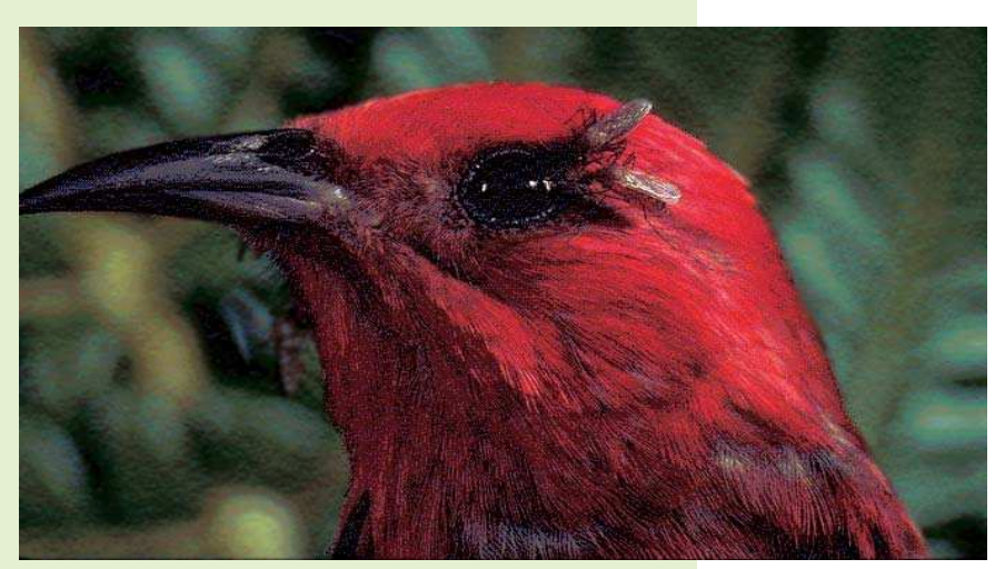
Honeycreeper with malaria carrying mosquitos

native birds, they have no resistance to avian malaria. Unique birds such the colour-ful honeycreepers, which evolved into a diverse array of species and subspecies to fill different niches, are threatened by this disease and by habitat loss. Avian malaria, through its mosquito vector has contributed to the extinction of at least 10 native bird species in Hawai'i and threatens many more.