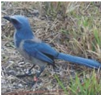
Florida Scrub-Jay.

TNR in Florida: Some counties, such as Palm Beach and Brevard, have amended their ordinances to allow cat colonies if the colony is registered with a desig-