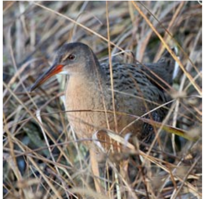
The federally-listed California Clapper Rail is a ground-nesting species that is especially vulnerable to cat predation.

Golden Gate Park, San Francisco: Twenty years ago, cats in San Francisco's Golden Gate Park were routinely removed, and California Quail were numerous. However, in the early 1990s, animal rights activists objected to the euthanasia of stray and feral cats trapped in the park. At the same time, underbrush was cleared from some areas of the park to discourage homeless people. As a result, the once abundant California Quail has all but disappeared from Golden Gate and other city parks. The city's Commission on the Environment passed a resolution in July 2000 to designate the California Quail as the official city bird. However, the resolution also specifies that quail restoration must be