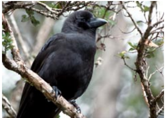
The 'Alala, or Hawaiian Crow, is the world's most endangered corvid. Populations of 'Alala have been decimated by introduced cats, rats, and other non-native predators.

captive-raised juveniles were released at McCandless Ranch. Of these, 21 died in the wild and six were recaptured and returned to the captive flock. Currently, no individuals are known to exist in the wild. There are currently 51 'Alala in captivity. Continued captive propagation of the 'Alala is required for its recovery. After the election of an appropriate release site, feral ungulates, rats and cats will have to be removed before re-introduction of 'Alala.