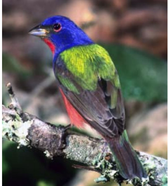
The Painted Bunting is an ABC Green List species at risk from feral and free-ranging cats in Florida.

In a Florida International University study, two managed cat colonies in Miami-Dade County (Crandon Marina and A.D. Barnes Park) were observed for 13 months. The number of cats in each colony remained relatively stable (with 91 cats at Crandon and 37 cats at Barnes), but the population dynamics changed. Almost every month, some cats disappeared and new cats joined the colonies. Adult cats and kittens were abandoned at each park during the study, despite state and county laws prohibiting pet abandonment. Cats that had not been spayed or neutered were observed at both sites, and some were not trapped for several months. Other cats were never captured. At Crandon, several females became pregnant and two of them gave birth in the park. Aggressive interactions among colony cats were few and mostly limited to the commencement of feeding. After the majority of cats fed, cats on the outskirts would eat, contrasting with the notion that