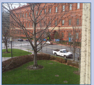
Window netting provides a see-through screen that will cut down on bird strikes.