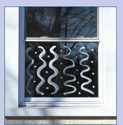
Tempera paint is a washable, long-lasting, and non-toxic solution to preventing bird/window collisions.