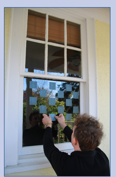
Window tape patterns are easy to apply and provide an effective deterrent against bird strikes. Shown is ABC Bird Tape.

Here are some quick and affordable ways to protect birds from your windows. These should be applied to the outside of the glass to break up reflections.