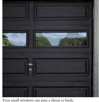
Even small windows can pose a threat to b

Research has identified solutions to alert birds to windows. The easiest of these involve applying visible markings to the outside of windows in patterns that the birds can see while requiring minimal glass coverage to keep your view unobscured. Although we don't yet have all the answers, we know that most birds will avoid windows with vertical stripes