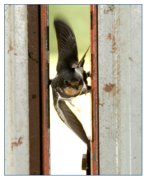
This Barn Swallow dove through the small space shown at top flight speed over 30 miles per hour!

Not all windows are equally hazardous. Check to see which of your windows are most reflective, and closest to areas where you see birds when they are active. Colli-sions happen more frequently during spring and fall migration periods or when resident birds fledge young or leave territories to seek food in winter.