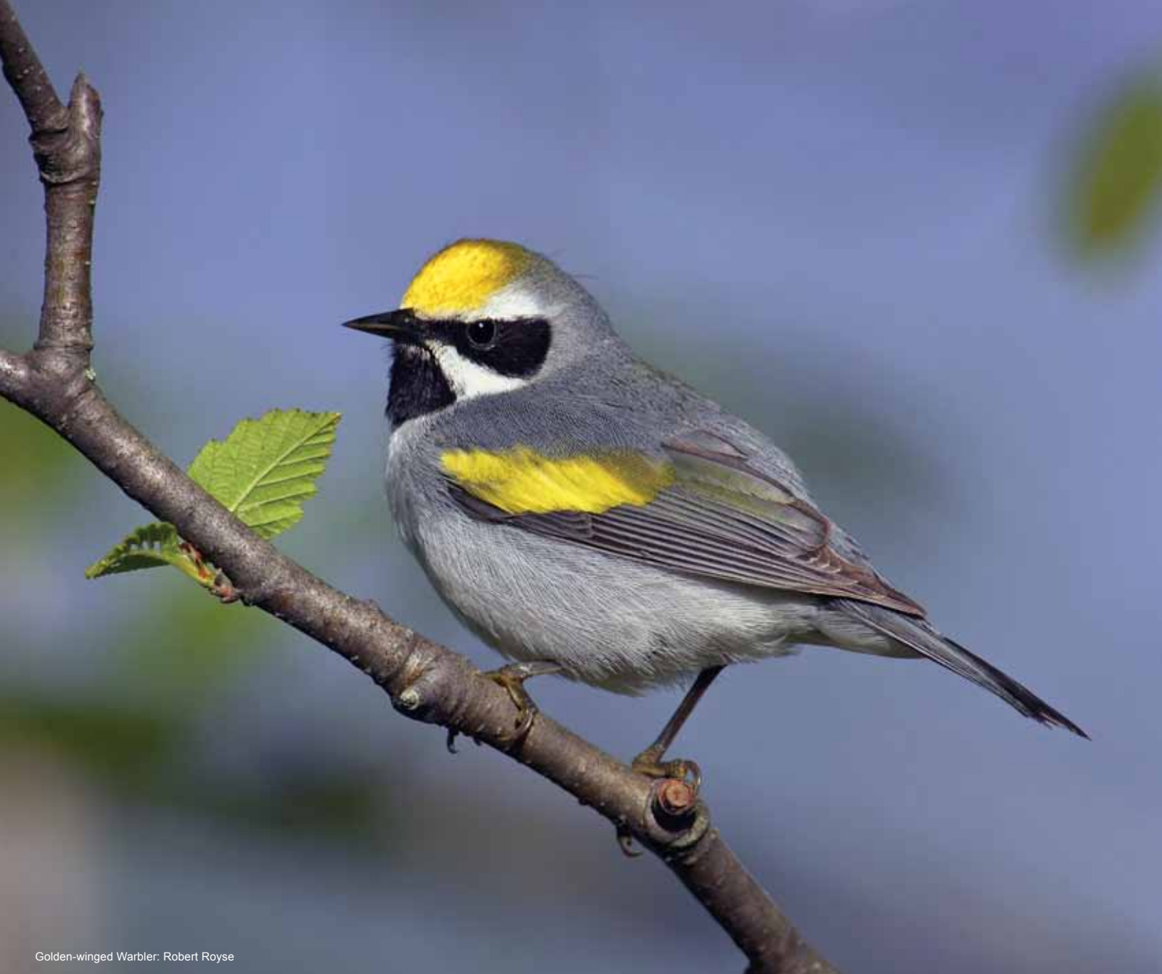
Golden-winged Warbler

American Bird Conservancy P.O. Box 249 The Plains, VA 20198 www.abcbirds.org abc@abcbirds.org 540-253-5780 • 888-247-3624