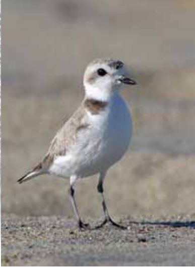
Snowy Plover: Tom Grey, Riparian habitat in Wyoming (background); FWS