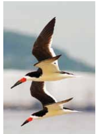
Black Skimmers: Tom Grey