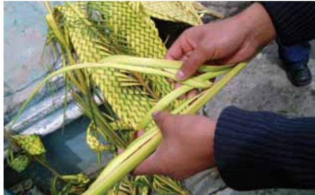
Using more common palm species for religious decorations preserves wax palm stands. Wax palms provide vital nesting habitat for endangered birds such as the Golden-plumed Parakeet.

Expanded: Working with ABC's partner Asociación Ecosistemas Andinos (ECOAN), the Abra Patricia Reserve was increased by 1,606 acres in 2006, providing significant new protected habitat for the globally threatened Ochre-fronted Antpitta, Johnson's Tody-