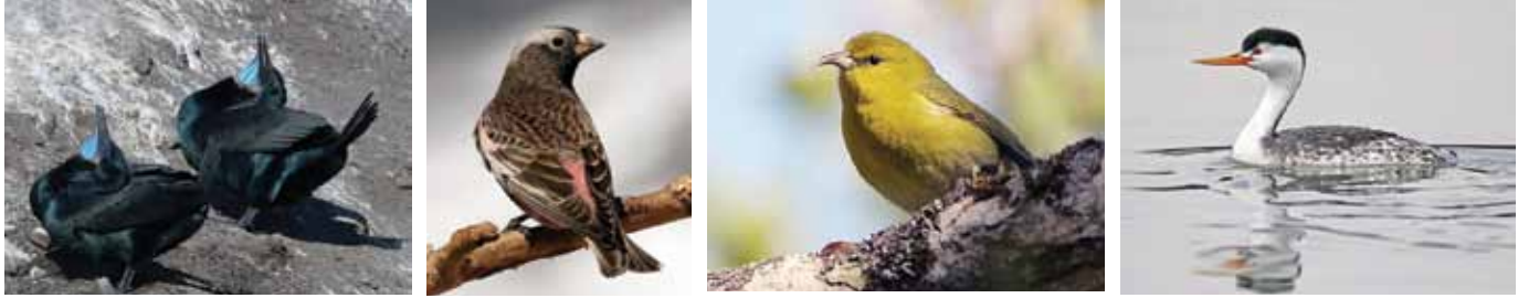
Left to right: Brandt's Cormorants: Black Rosy-finch: Kauai Amakihi: Clark's Grebe