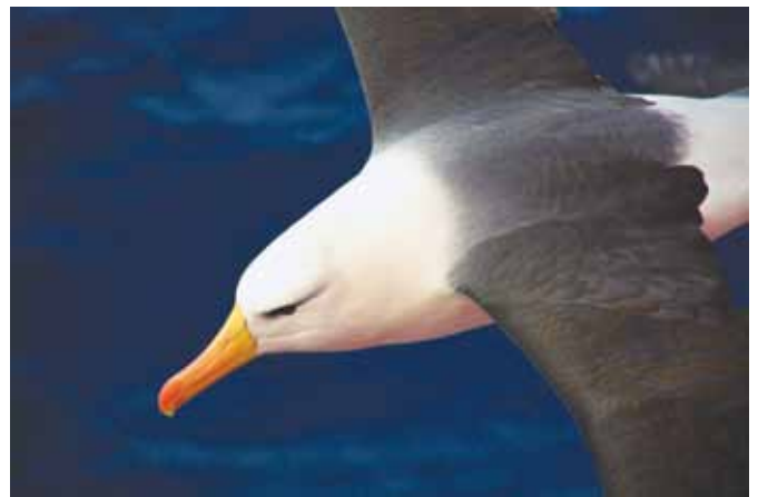
Black-browed Albatross: Wejens Dimmlich

ABC Ensures Seabird Bycatch Language Added to Reauthorized Magnuson-Stevens Act: In 2006, Congress voted on the reauthorization of Magnuson-Stevens, the 30-year-old law that oversees fishery management in U.S. waters. ABC used this opportunity to push for amendments to the Act that would prevent albatross and other seabird mortality by U.S. fishing vessels without decreasing or impeding fishing efficiency. Through effective advocacy on Capitol Hill, ABC policy staff successfully included language that creates a mandatory bycatch reduction program. Senate Commerce Committee staff agreed to allow fisherman to tap federal grant money, to upgrade equipment that would reduce seabird bycatch, and to make seabird bycatch a priority