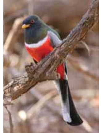
Collared Trogon