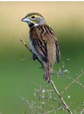
Dickcissel: Bill Hubick

Improving Habitat for High Priority Birds in the Central Hardwoods: ABC worked with five state agencies, the U.S. Fish and Wildlife Service, USDA Forest Service, Wildlife Management Institute, and the National Wild Turkey Federation to improve more than 30,000 acres of critical habitat for declining bird species. Grassland management that included planting native, warm-season grasses, mowing, and prescribed