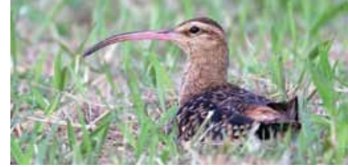
Bristle-thighed Curlew: Bill Hubick