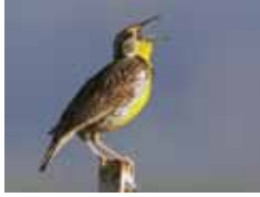
Western Meadowlark: Tom Grey