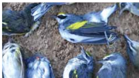
These Golden-winged Warblers, among other bird species in this photo, were killed colliding with a single communications tower.

In 2006, ABC and its partners inched closer to a solution to prevent the unnecessary deaths of as many as 50 million birds per year at the more than 100,000 communication towers in the United States.