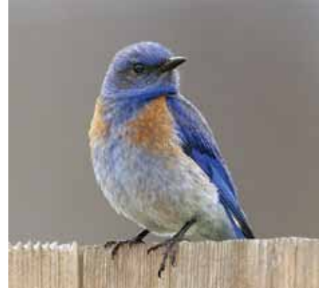
Western Bluebird: Tom Grey