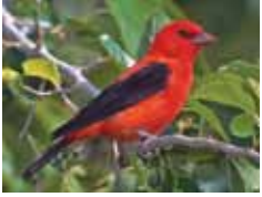
Scarlet Tanager: Peter LaTourrette, www.birdphotography.com