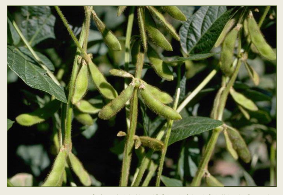
Soybean plants