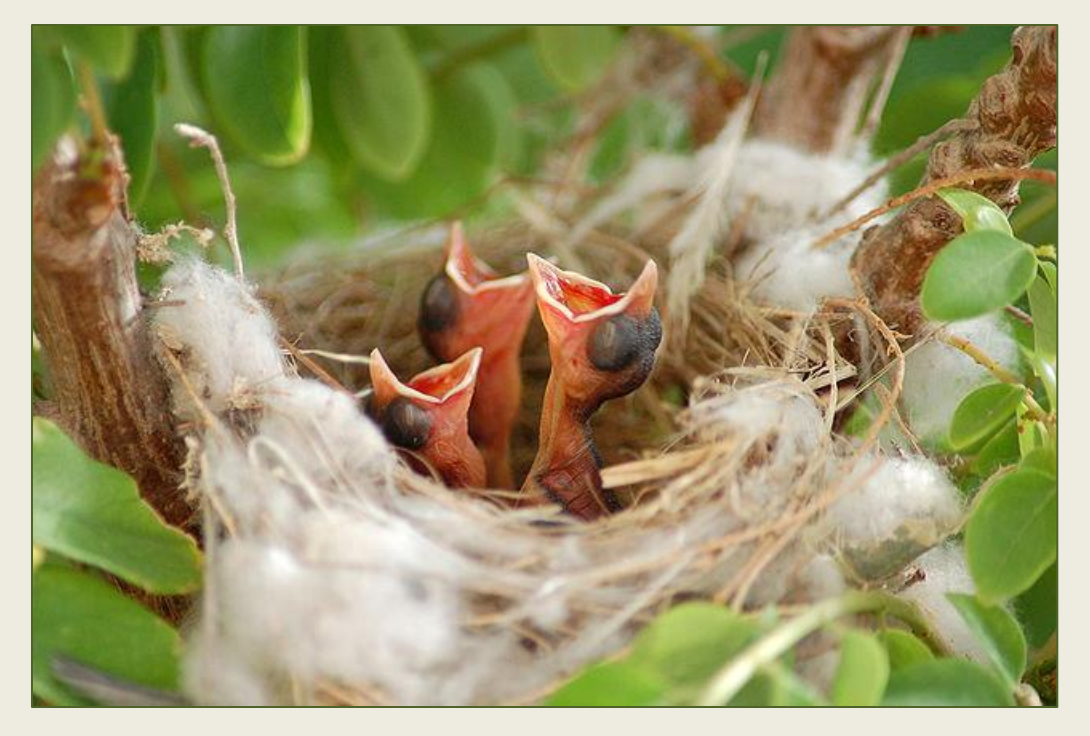
Altricial chicks