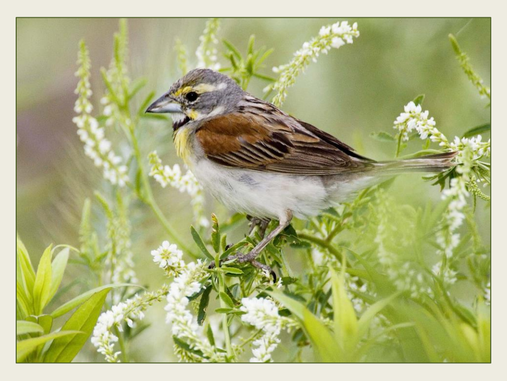
Dickcissel