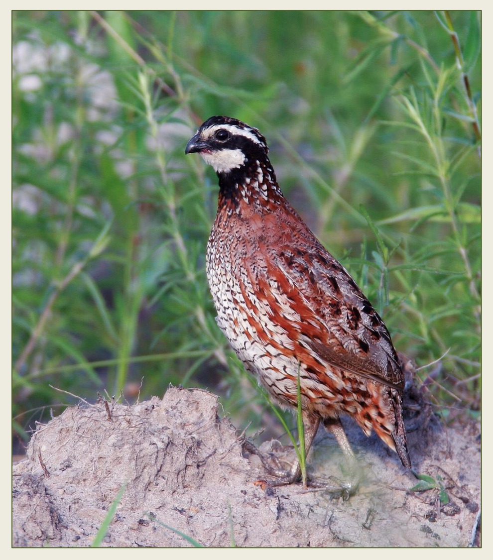
Northern Bobwhite