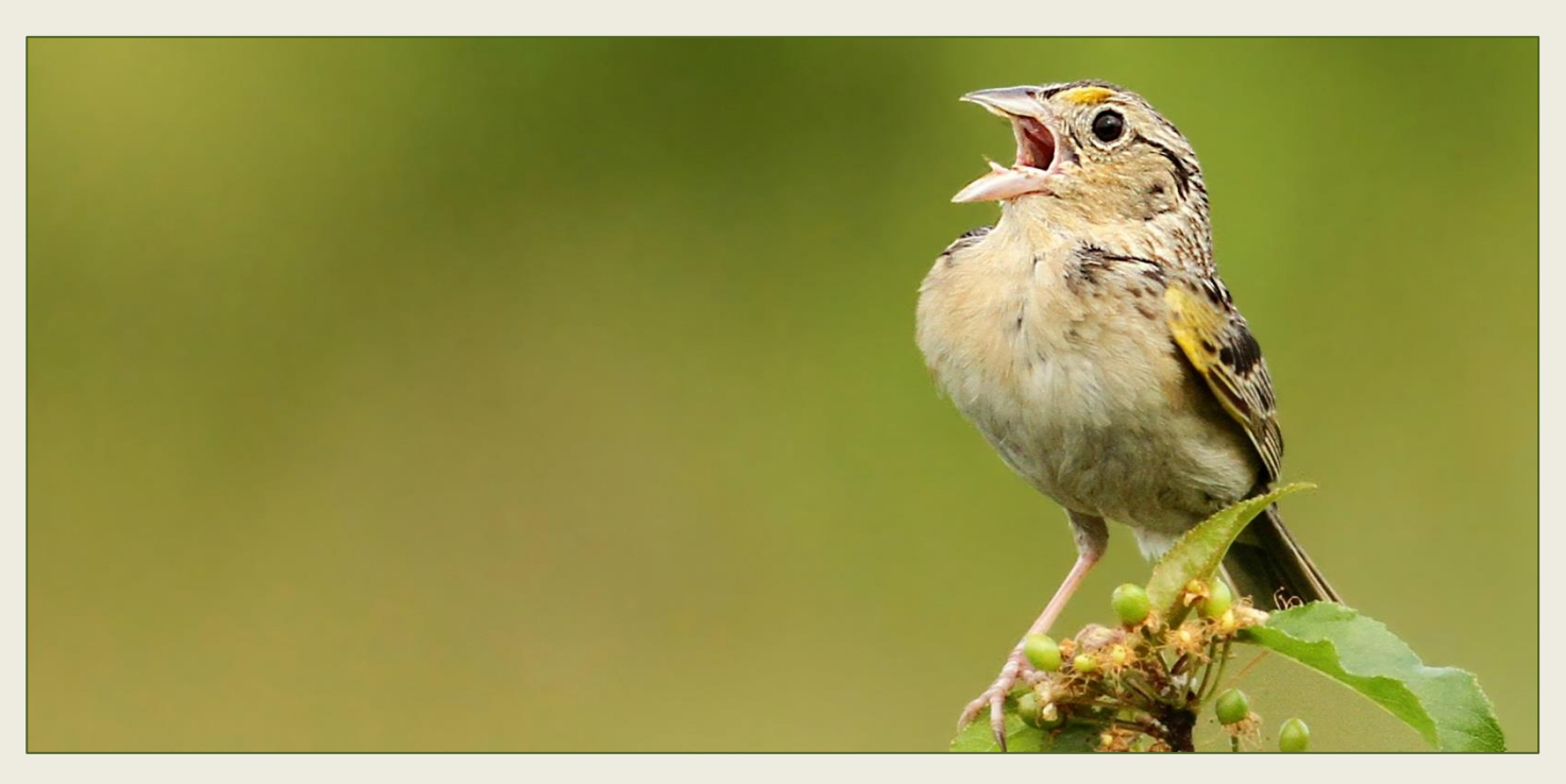
Grasshopper Sparrow

Cover photos: Horned Lark and chicks by Middleton Evans; Corn field, stock.xchng, sxc.hu; Calico Pennant dragonfly by David Cappaert, Michigan State University, Bugwood.org