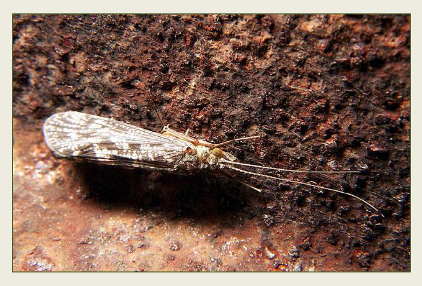
Caddisfly