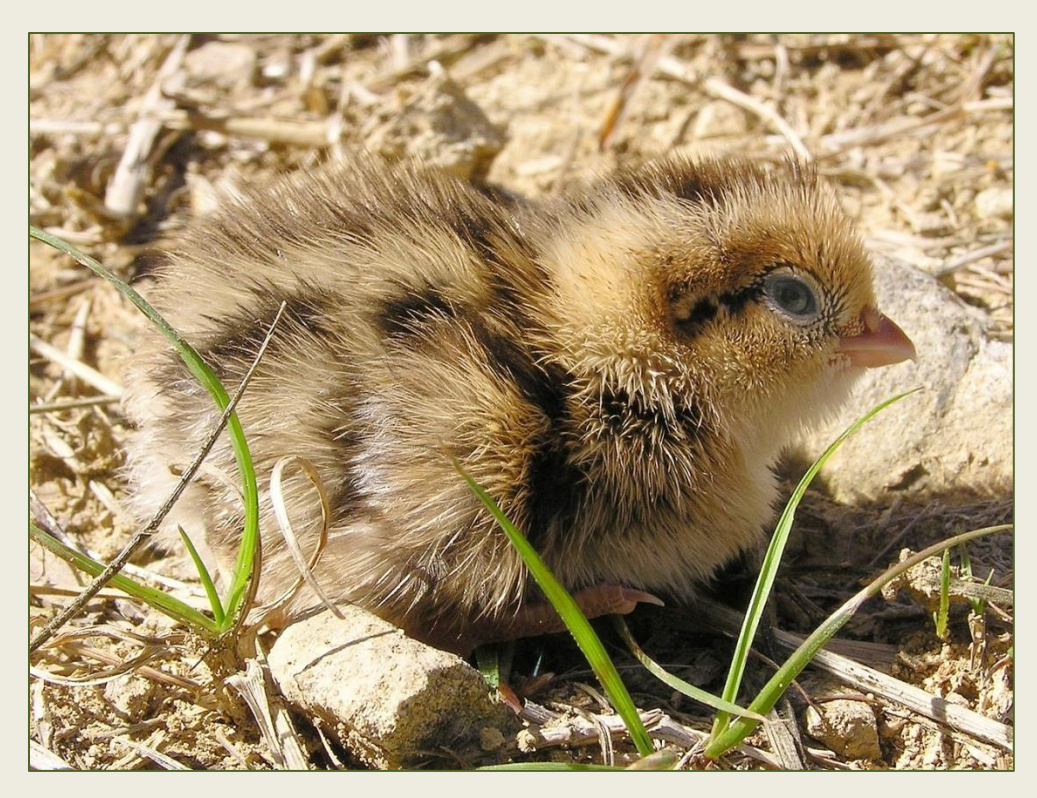
California Quail chick