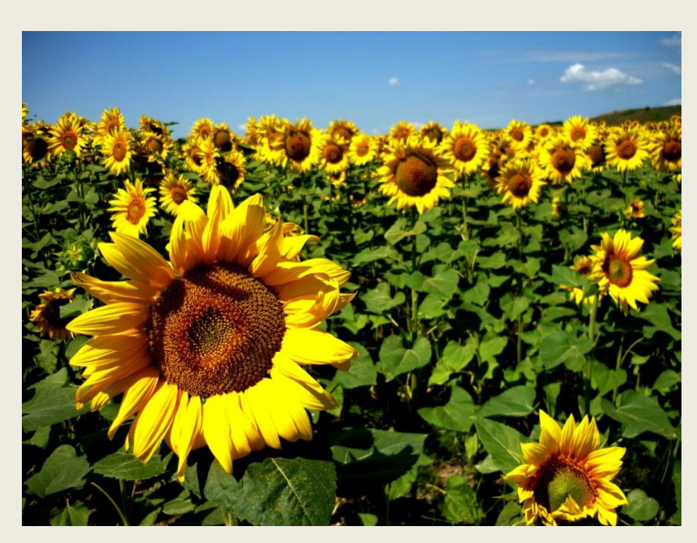
Sunflower field