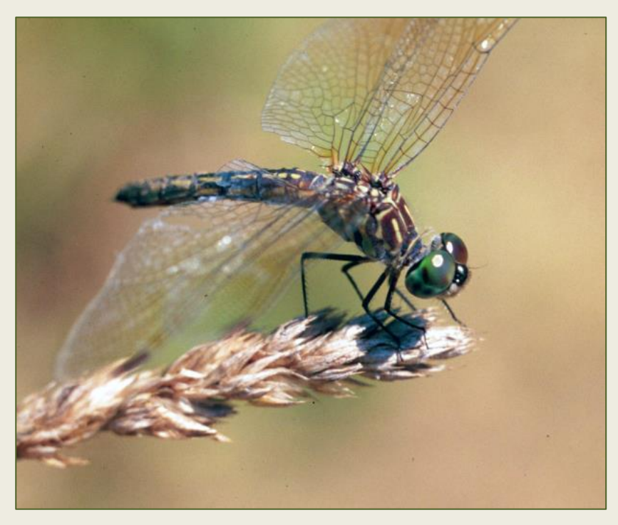
Dragonfly on wheat

A species sensitivity distribution based on the normally distributed acute data returns an HC5 of 1.01 ug/l for crustacea (0.06-6.8) and an almost identical 1.02 ug/l for aquatic insects (0.31-2.06). Despite the overlap, the insects appear to have a much lower sensitivity variance – i.e. more similarity in response. A pulse of imidacloprid in the ug/l range would therefore be expected to affect a larger proportion of the insect community.