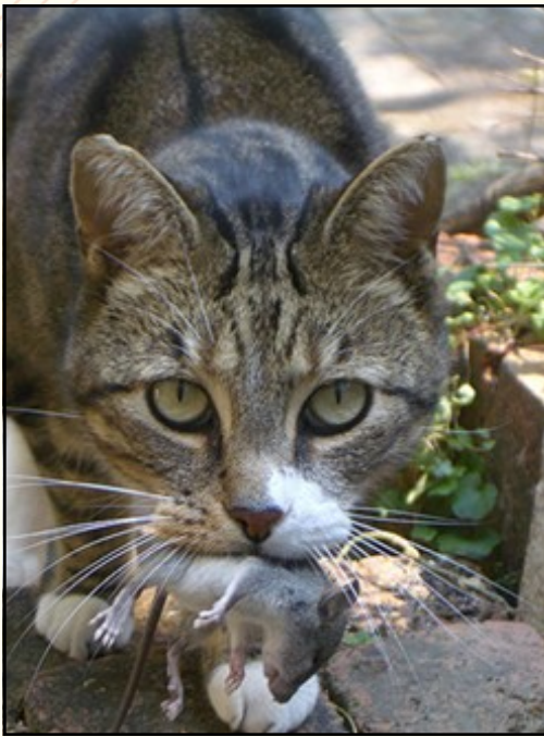
A domestic cat carries its prey. Free-ranging and feral cats kill billions of animals each year.