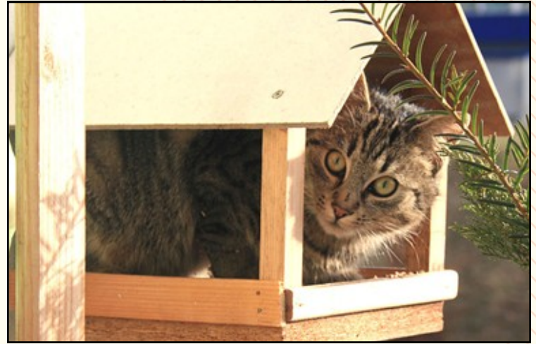
A domestic cat peers out of a bird feeder. Cats are known to predate on wildlife including many birds. (Credit: Wikimedia Commons User Karelj).

Humans provide a potential mechanism for disease transmission when they establish outdoor feeding stations for feral cats. Managed feral cat colonies bring together all the elements necessary to create a high risk of disease transmission from cats to people or wildlife -- concentrated