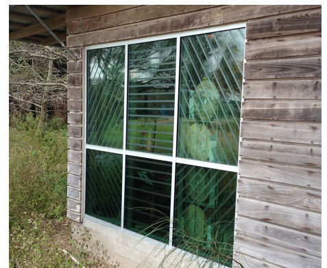
ABC Birdtape, shown here on a window at the Estero Llano Grande State Park, Texas, can be applied in strips or blocks.