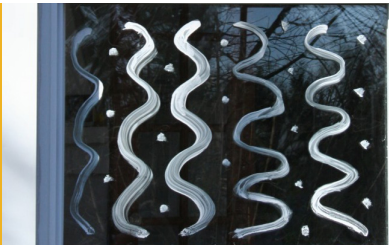
Tempera paint is a washable, long-lasting, and non-toxic solution to preventing bird/window collisions.