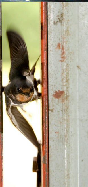
This Barn Swallow dove through the small space shown at top flight speed —over 30 miles per hour!

See other side for specific solutions and where to find them. Windows with screens should already be safe for birds.