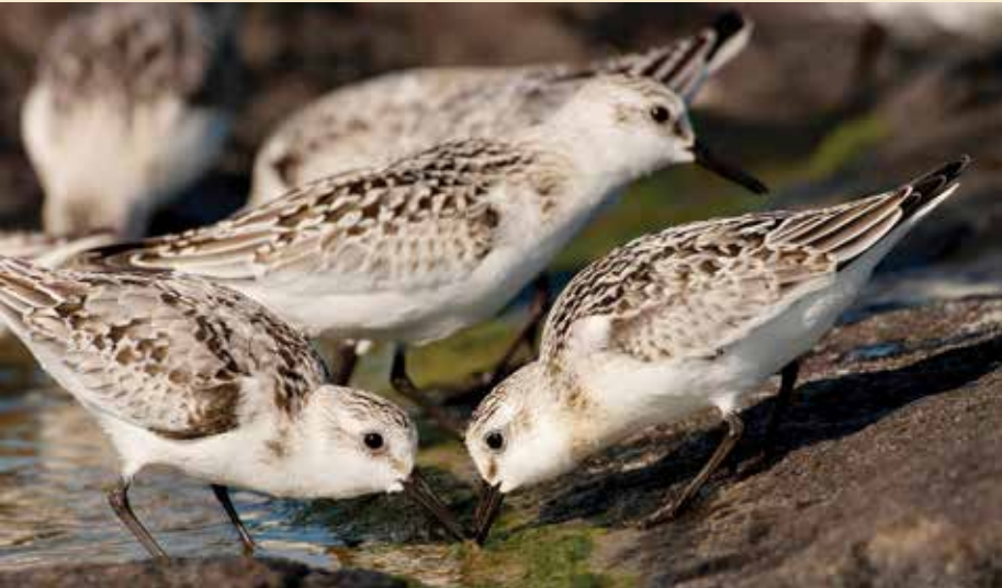
TOP: Cerulean Warbler LEFT: Sanderlings