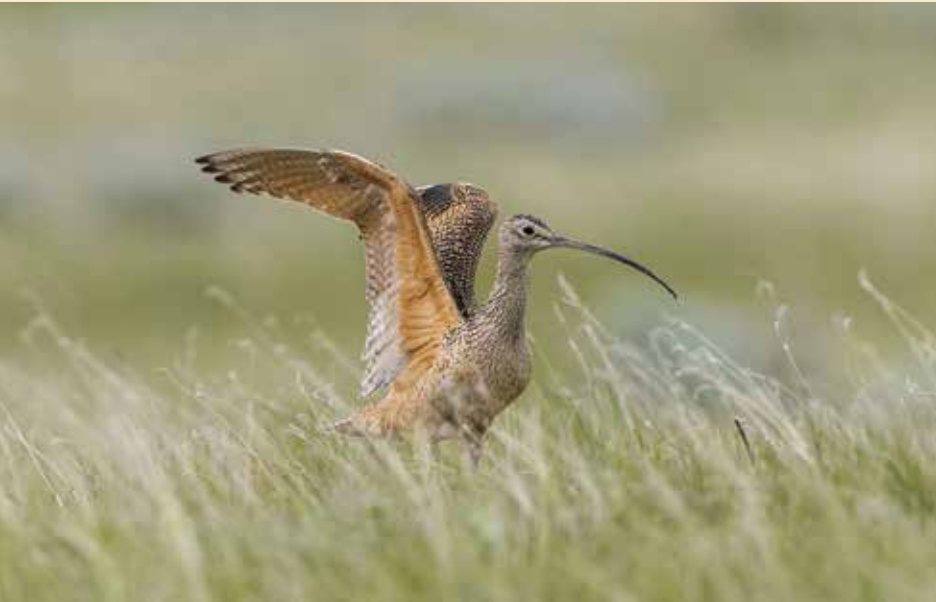
Long-billed Curlew