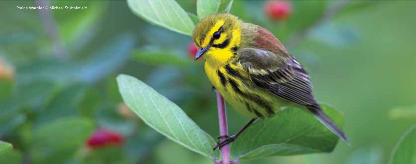
Prairie Warbler

American Bird Conservancy’s financial statements for the year ending December 31, 2017 were audited by the certified public accounting firm of Gelman, Rosenberg, and Freedman. A copy of ABC’s complete financial statements can be obtained by contacting: American Bird Conservancy, P.O. Box 249, The Plains, VA 20198 or on our website at abcbirds.org .