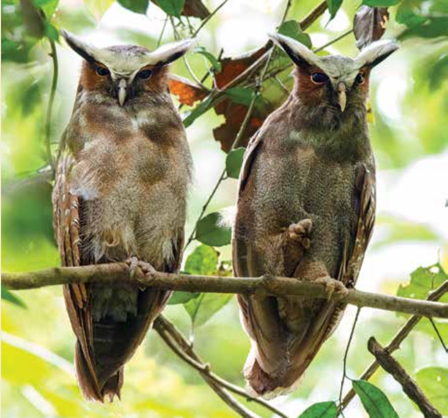
Crested Owls by Owen Deutsch