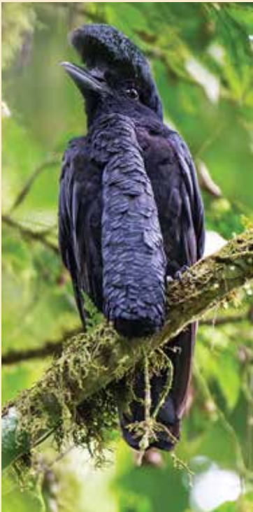
Long-wattled Umbrellabird

San Antonio Quail Coalition Southeast Association of Fish and Wildlife Agencies Southern Wings State of Hawai'i State of Minnesota Outdoor Heritage Fund State of Oregon State of Tennessee State of Texas Sustainable Forestry Initiative Tennessee Wildlife Resource Agency Tennessee Wildlife Resources Foundation Texas A&M University Texas Parks & Wildlife Department United Nations Environment Program U.S. Army Corps of Engineers USDA Forest Service USDA Natural Resources Conservation Service U.S. Fish and Wildlife Service Virginia Department of Game and Inland Fisheries Wisconsin Department of Natural Resources