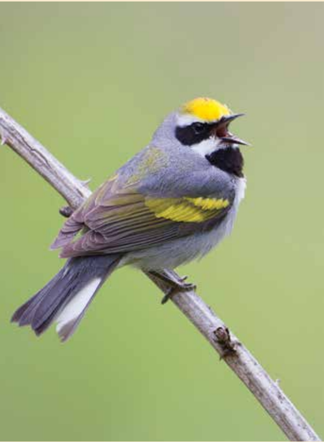
Golden-winged Warbler