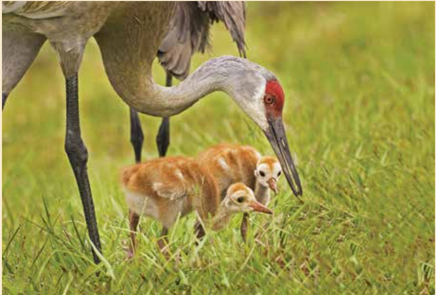
TOP: Peregrine Falcon ; RIGHT: Sandhill Cranes