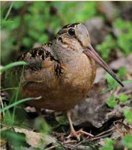
American Woodcock