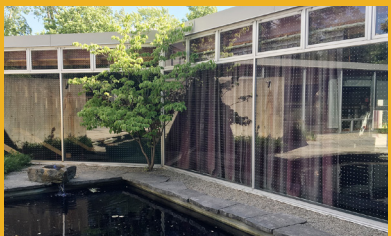
Feather Friendly Residential is applied as a tape, but the backing is removed, leaving a pattern of dots.