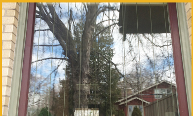
You can make a Zen wind curtain with cord, or anything that will hang in front of the glass at 4" intervals.