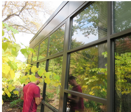
Solyx Bird Safety film covers the entire glass surface of this building at the Bronx Zoo.