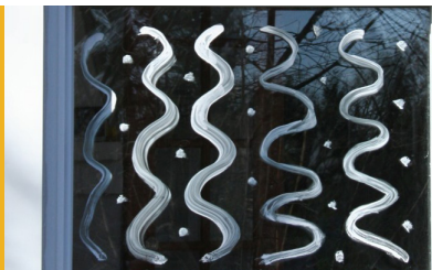
Tempera paint is a washable, long-lasting, and non-toxic solution to preventing bird/window collisions.