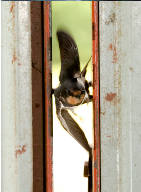
This Barn Swallow dove through the small space shown at top flight speed —over 30 miles per hour!

See other side for specific solutions and where to find them. Windows with screens should already be safe for birds.