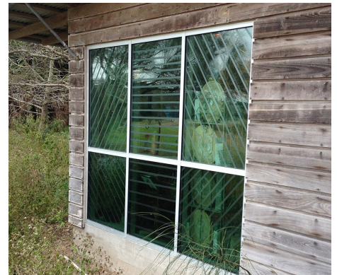
ABC Birdtape, shown here on a window at the Estero Llano Grande State Park, Texas, can be applied in strips or blocks.